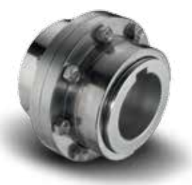
Falk Lifelign Gear Couplings