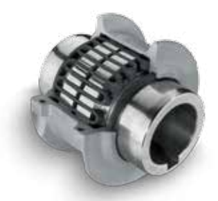
Falk Steelflex Grid Couplings