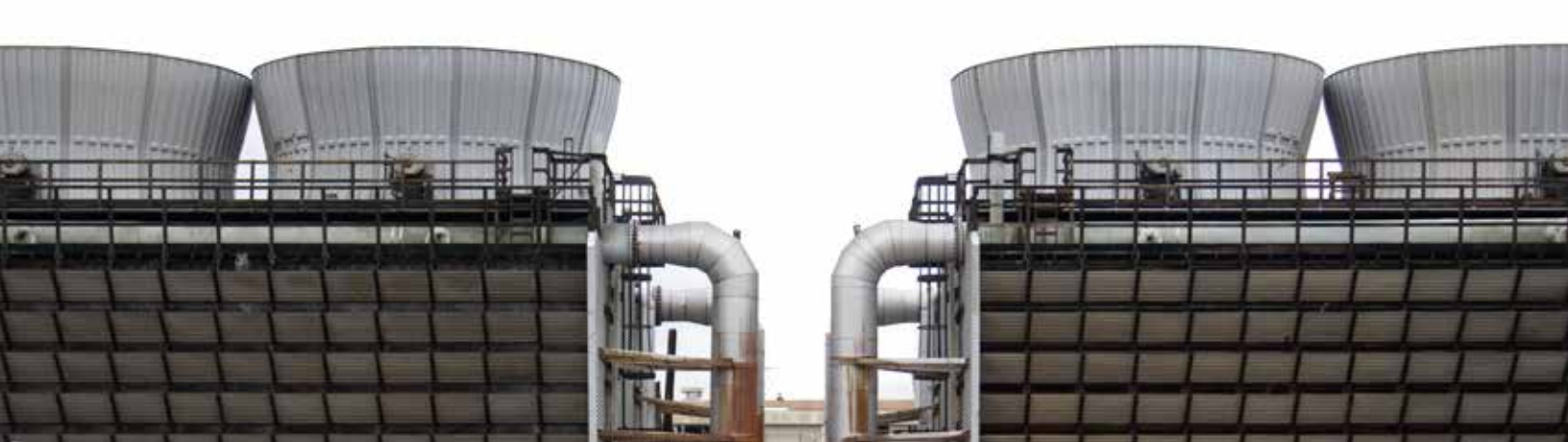
Rexnord Addax Composite Couplings

Rexnord Addax Composite Couplings are ideal for cooling tower applications. The composite material offers superior corrosion resistance and minimal thermal expansion relative to steel shafts. Additionally, these couplings feature a lighter weight for ease of installation. A mechanical brake is also available to eliminate potentially hazardous shaft rotation during maintenance.